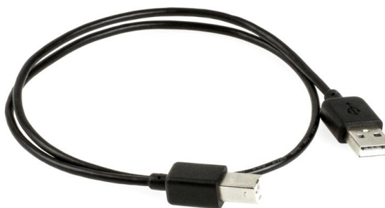
whiteflex black edition