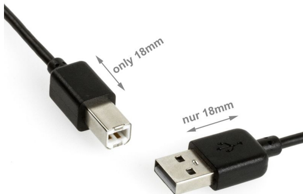
whiteflex black edition