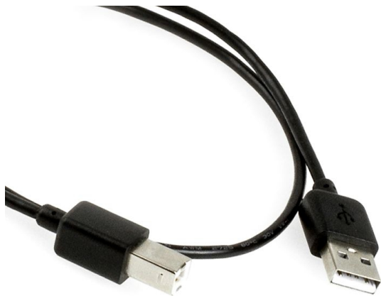
whiteflex black edition