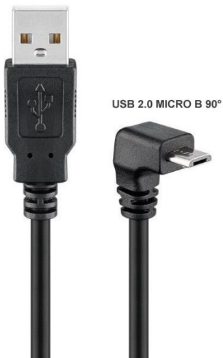
USB 2.0 MICRO B 90°